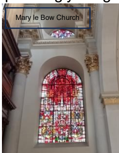
Mary le Bow Church